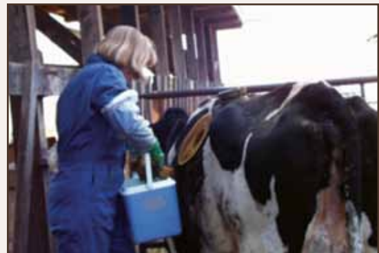
Figure 2. Rumen fistulated cow, West Virginia University